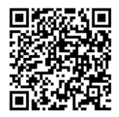
Questions to Ask a Candidate - Images DALC